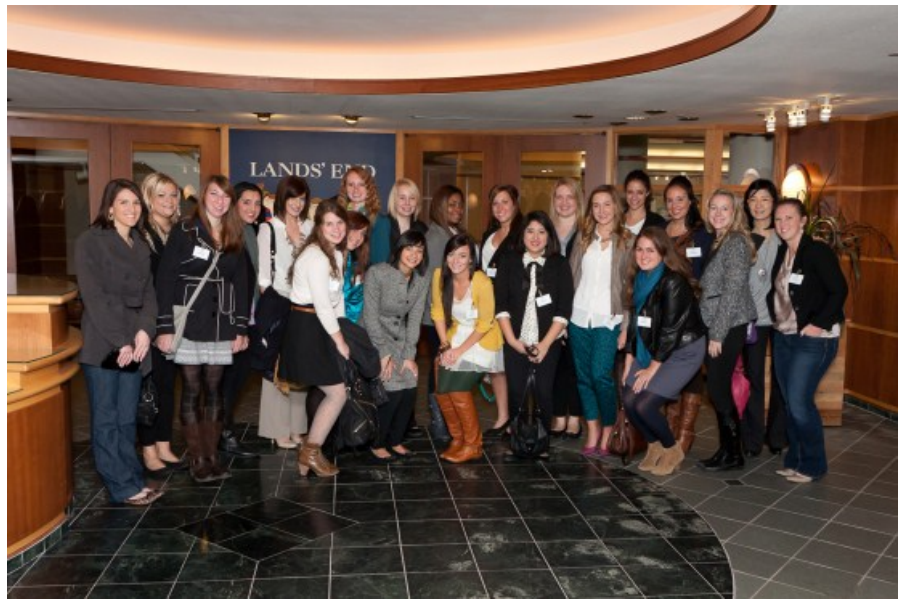
AMDA students at the Lands' End headquarters

The Apparel Merchandising and Design Association is a Registered Student Organization at ISU that focuses on the apparel merchandising and design aspects of the fashion industry. These students meet on a monthly basis to discuss topics such as internships, hear speakers from the industry or volunteer for the community in a variety of ways. Each fall, the AMDA visits a nearby industry location. Previous trips have included visits to the 1154 LILL Manufacturing facility and design office in Chicago, Target Corporate Headquarters in Minneapolis, Brown Shoe Company in St. Louis and most recently to Lands' End outside Madison, WI.