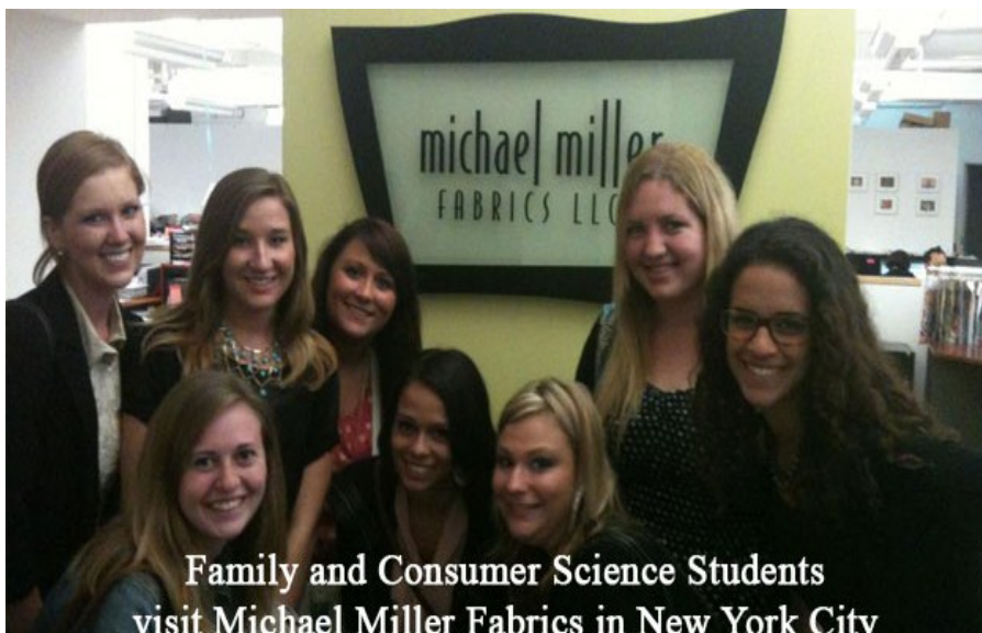
Family and Consumer Science Students visit Michael Miller Fabrics in New York City